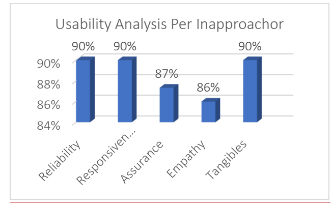
Figure 7. Percentage of spread usability value per indicator

From the analysis of the questionnaire results data against the usability test of the academic data visualization dashboard system using Google Data Studio, the results of the usability test assessment of the system were obtained, as shown in figure 7.